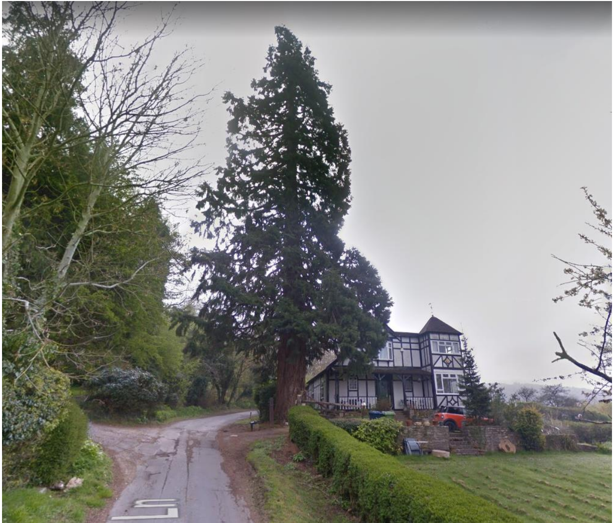
Google screenshot April 2019